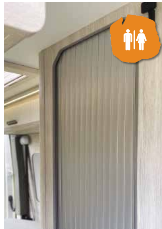
Detail of the hermetic sliding door, for a perfect sealing of the bathroom, which has a folding window for ventilation.