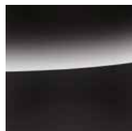
Deep Black Pearl