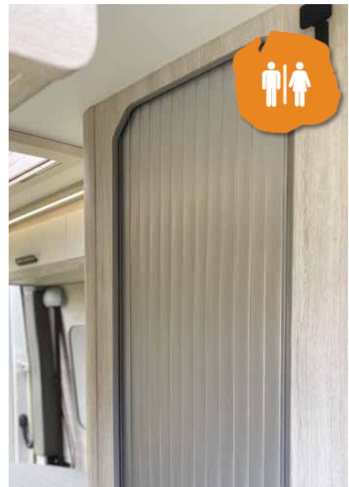
Detail of the hermetic sliding door, for a perfect sealing of the bathroom, which has a folding window for ventilation.