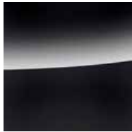
Deep Black Pearl