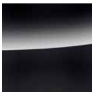
Deep Black Pearl